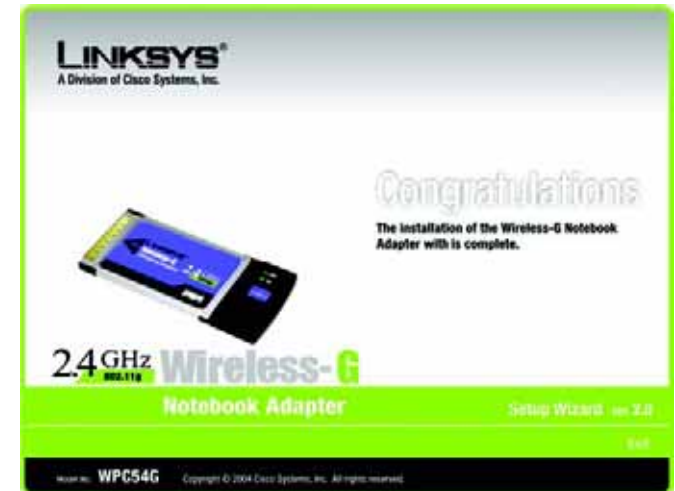
Figure 4-8: The Setup Wizard's Congratulations Screen

Proceed to “Chapter 5: Hardware Installation.”